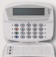
Icon Code Pad