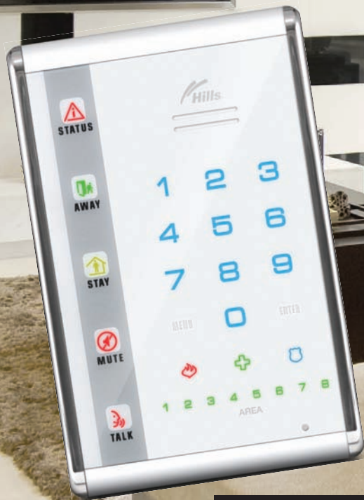
Hills Reliance VoiceNav