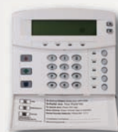
LCD Code Pad