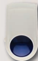
Combo Siren & Strobe