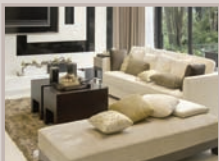
Distributed Audio System

Imagine being able to select your favorite music from one of four sources (e.g. MP3 player, computer, CD player, radio) in different locations within your home. You'll love the Hills Home Music system.